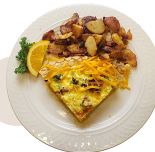
Broccoli Cheddar Bacon Quiche

NOTE: Prices shown are for cash payments. A 3.5% non-cash adjustment will be applied for those paying with credit/debit cards