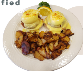
Crab Cake Benedict

Eggs Benedict $14 Two poached eggs and Canadian bacon on an English muffin with hollandaise sauce.