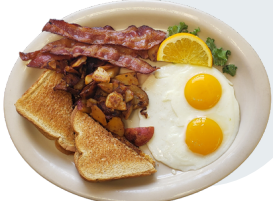
Two Eggs, Meat, Homefries, & Toast

Served with homefries and toast, unless otherwise specified