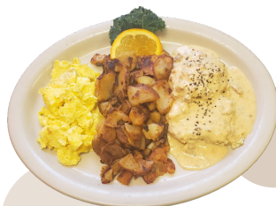
Italian Biscuits & Gravy

Peppers, onions, potatoes, tomatoes, spinach & swiss