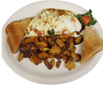
Chicken Fajita Omelette

Served with homefries, toast, and a choice of cheese unless otherwise specified