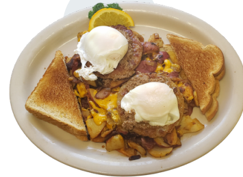
Five Mile Plate

Seasoned strip steak, choice of egg with homefries and toast